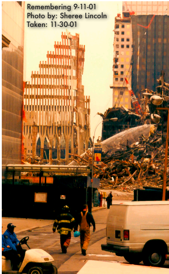
Remembering 9-11-01 Taken: 11-30-01